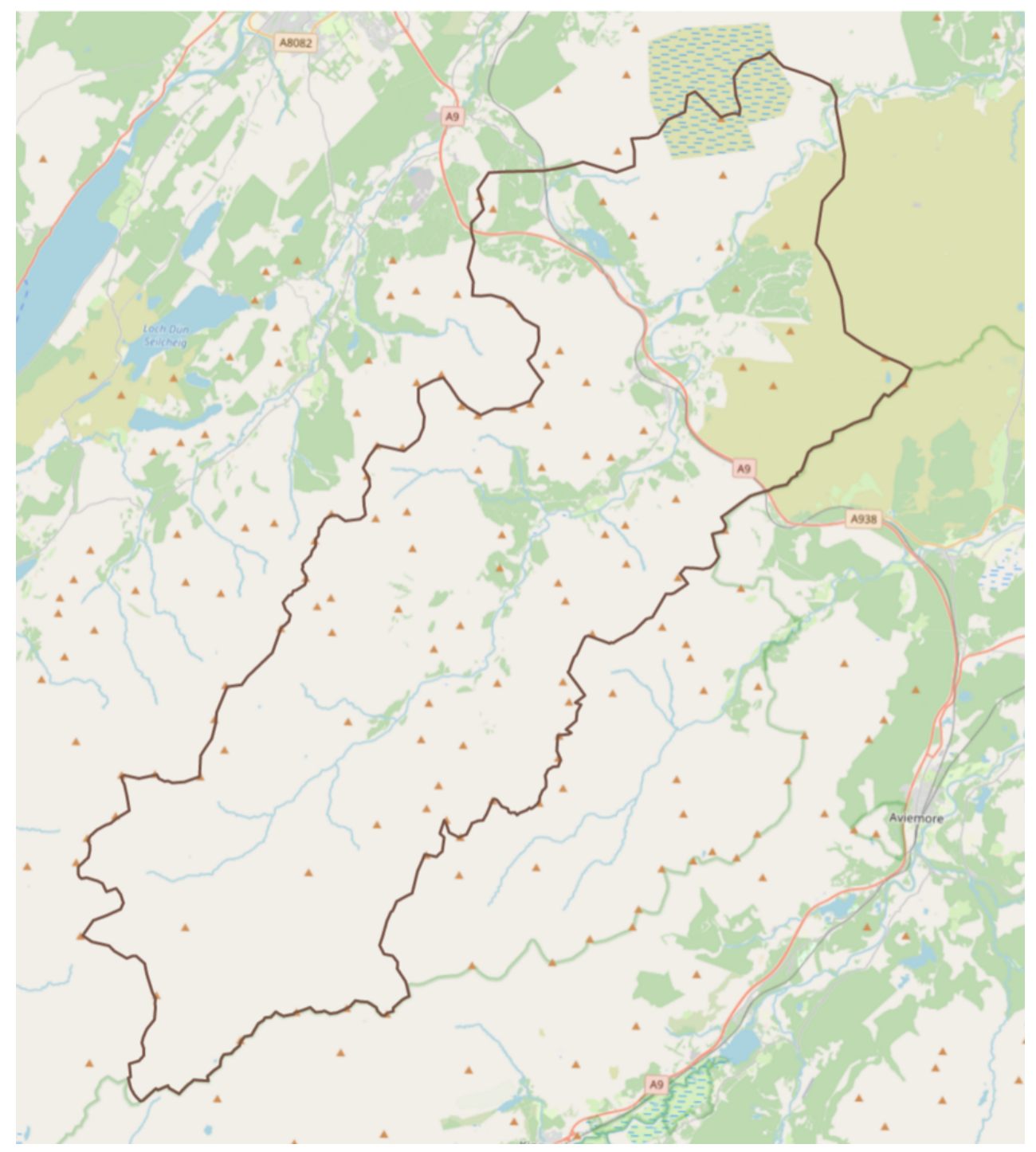
Map 1: Upper Findhorn catchment